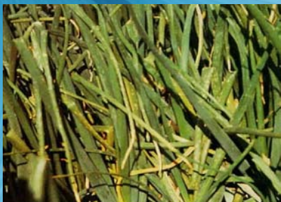
Botrytis Leaf Blight (Blast)