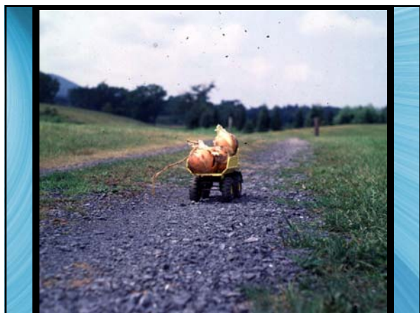
Harvested onion bulbs in bulk bin or 50 lb burlap bags