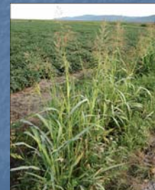
Photo: Johnsongrass ( Sorghum halepense)