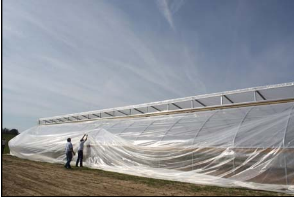
Pulling up the Double-wall