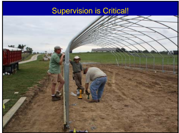
Supervision is Critical!