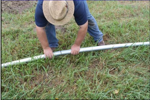
Connecting the Pieces