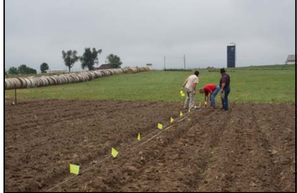
Site Preparation: Flagging the Bows