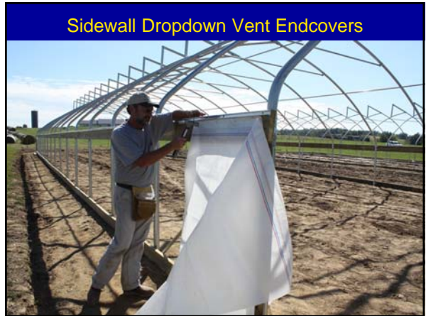
Sidewall Dropdown Vent Endcovers