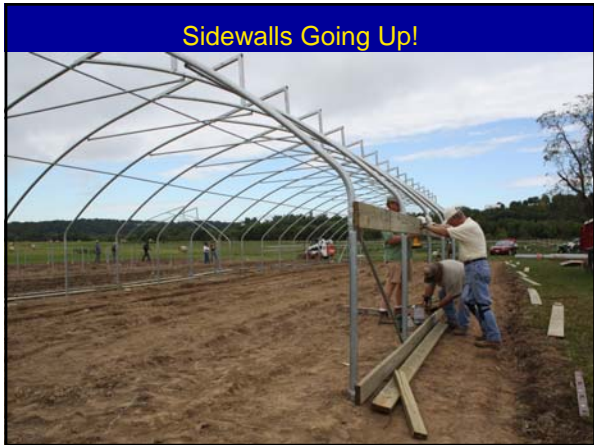
Sidewalls Going Up!