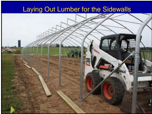
Laying Out Lumber for the Sidewalls