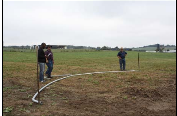
Assembling the Pieces