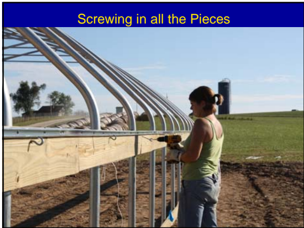
Screwing in all the Pieces