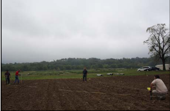
Site Preparation: Squaring using the 3-4-5 Rule