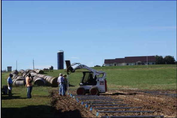
Driving the Sidewall Posts