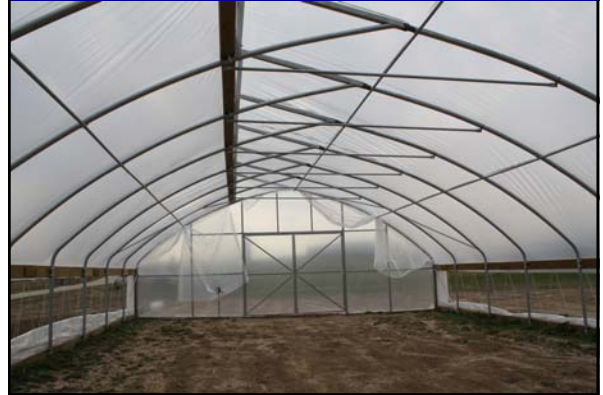
A View from the Inside